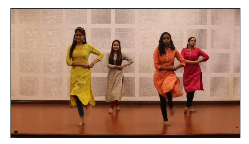
A dance performance by the Dance Community Group