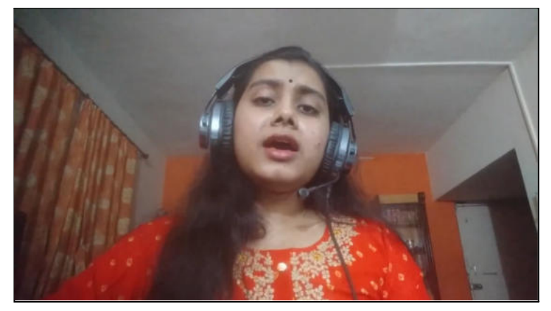
VESITians showing their classical singing talent.